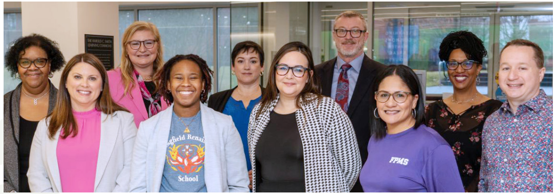
Members of Springfield College, Springfield Public Schools, and Holyoke Public Schools gathered recently to acknowledge the $3.29 million Department of Education grant awarded to the Springfield College Department of Counseling.