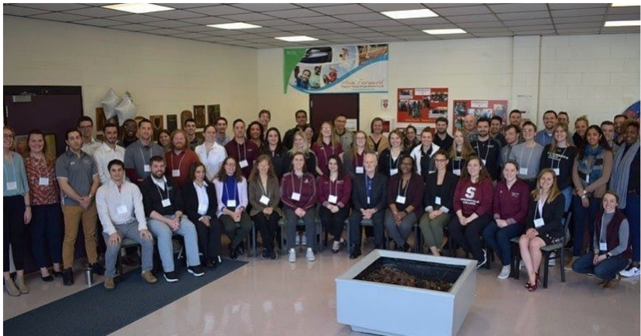
AASP Northeast Regional Conference 2020