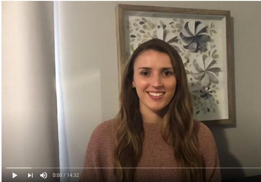
Springfield College Clubs and Organizations Awards 2020